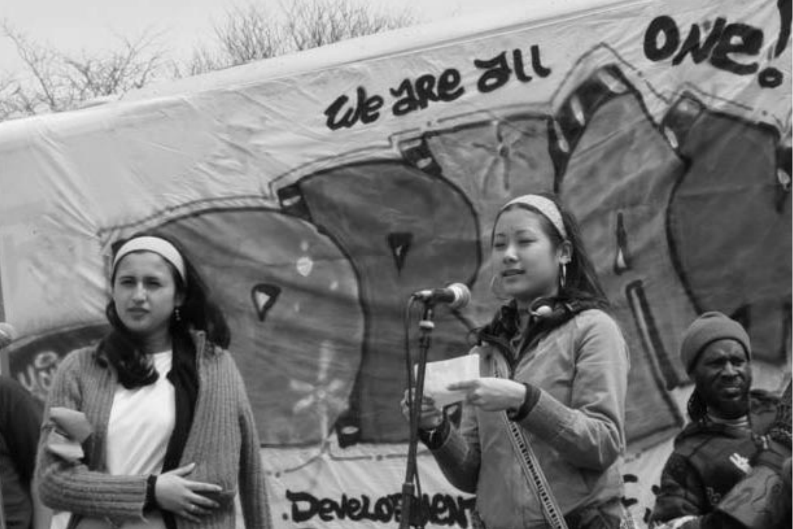
Global Kids, Inc.

Education Office for Civil Rights (OCR) report. The OCR had investigated the school district's practices in referring children to special education. The report found that the enrollment of African-American and Hispanic students in special education was disproportionately high, with such children often being sent to the "most restrictive" settings in BOCES (the Board of Cooperative Educational Services), a vocational high school outside Vanhold. The school district had to redress its practice of over-referring children of color.