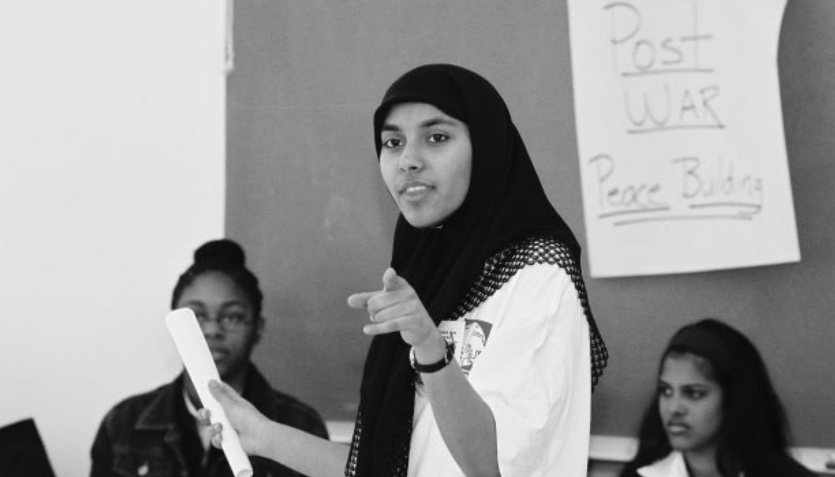
Global Kids, Inc.

When I discussed the case of the Vanhold school district with an OCR officer, I put forward the perception I had heard mentioned by parents and staff that BOCES created obstacles to keep children from being mainstreamed out of special education and placed back into the district. The officer, an African-American woman, responded, “BOCES teachers are convinced . . . that children will not function well in a regular classroom. They have lowered their expectations of these children” (personal communication, May, 2000). She mentioned that the state is now beginning to offer incentives for districts to remedy over-referral to special education, encouraging them to bring children back into the district by offering money for smaller classes and resources for earlier academic intervention.