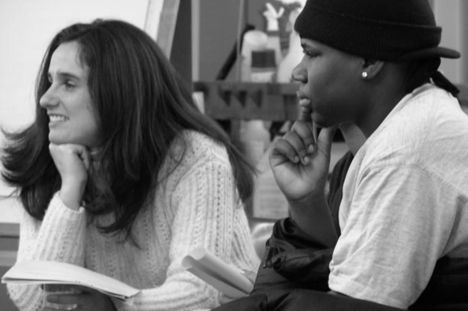
United Neighborhood Houses Citywide Teen Council members from Goddard Riverside Community Center

also important emphases in Harmony Center's programming. Older youth were encouraged to participate in the Youth Council—a group that plays an advisory role with the executive director and board—as well as to tutor younger children. Youth from Harmony Center were also engaged in a community clean-up campaign with youth from a local synagogue, testified at public countywide hearings, and participated on local councils and committees. Lastly, although Harmony Center provided plenty of activities and ample opportunity to work with adults, it also gave children unstructured time in which they could simply be children together.